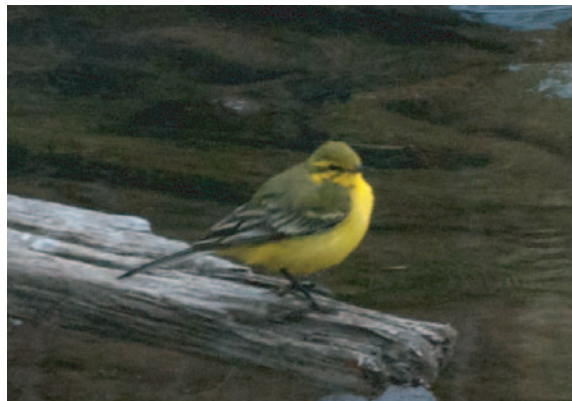
Fig. 2 - Yellow-crowned Wagtail, Motacilla flava flavissima at Machico, Madeira, on 17-04-2011.