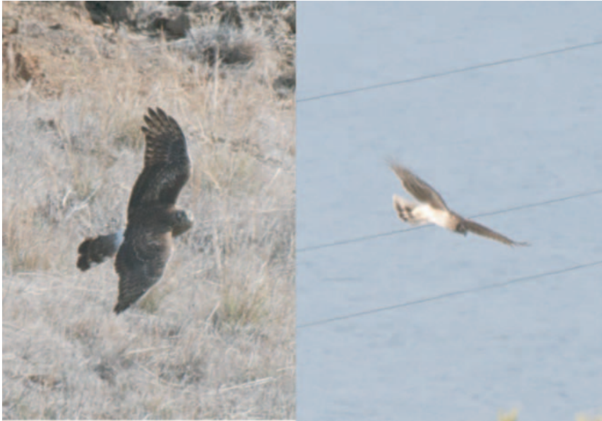
Fig. 1 - Hen Harrier, Circus cyaneus at Caniçal, Madeira, on 10-11-2011 (left) and 27-12-2011 (right).