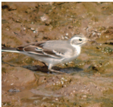
Fig. 3 - Citrine Wagtail, Motacilla citreola at Lugar de Baixo, Madeira, on 10-09-2011.