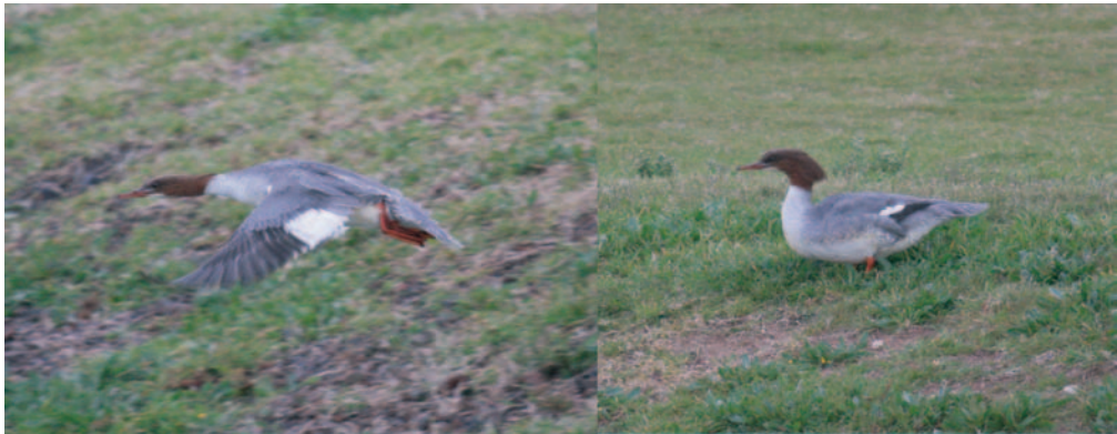
Fig. 5 - Common Merganser, Mergus merganser at Porto Santo Golf course, on 08-01-2011.